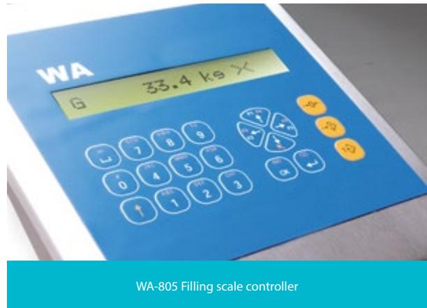
WA-805 Filling scale controller

After each aborted or completed batch, weigh data are automatically printed and totalized. Accumulation contains the cumulative total of NET weights and the number of totalized batches. Accumulation can be displayed and printed.